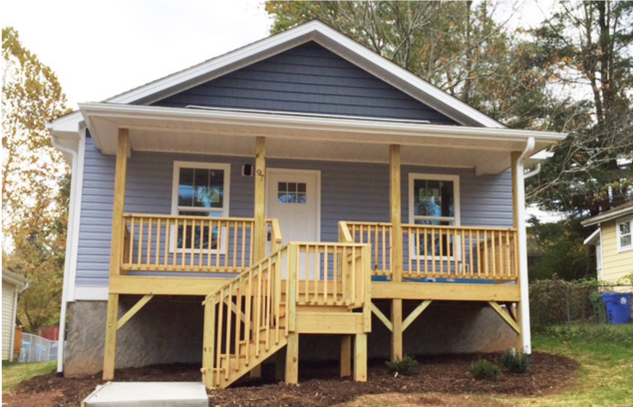
2 bedroom, 1 bathroom 901 square feet

mtnhousing.org Turn Key Affordable Homeownership